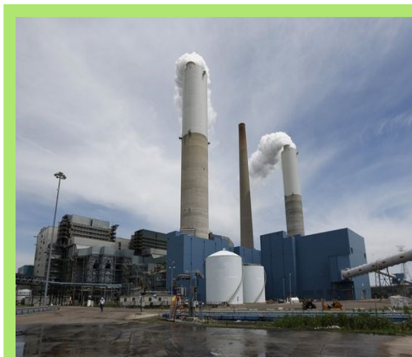
DTE Energy's Monroe Power Plant

Children, the elderly, and people with asthma, cardiovascular disease or chronic lung disease (such as bronchitis or emphysema), are most susceptible to adverse health effects associated with exposure to SO 2 . 1