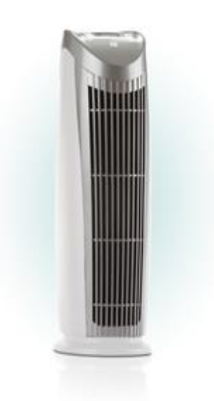
Figure 7.2-2: HEPA air filter/purifier, an example of a free-standing air filter.<sup>2</sup>

A second type of device is a <u>free standing</u> or <u>portable filter unit</u>. These can be installed anywhere there is an electrical power outlet. These portable units clean the air in a single room (and help to clean air in nearby rooms). These filters can operate year round, including times when a forced air system is not being used (e.g., when heating or cooling is not being used.) This type of filter is also useful when a house or building does not have a forced air system, for examples, in houses with steam radiators or baseboard heat.